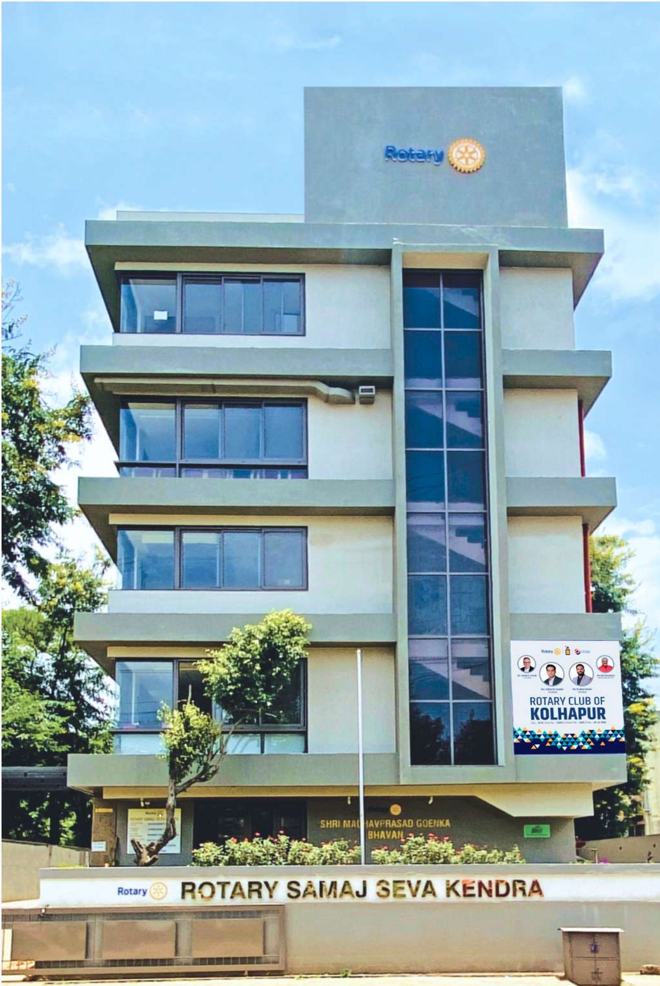
ROTARY CLUB OF KOLHAPUR’S ROTARY SAMAJ SEVA KENDRA BUILDING

We will be conducting our business meeting for the month of Aug 2023. Venue: RSSK, Kolhapur Time: 5:30PM